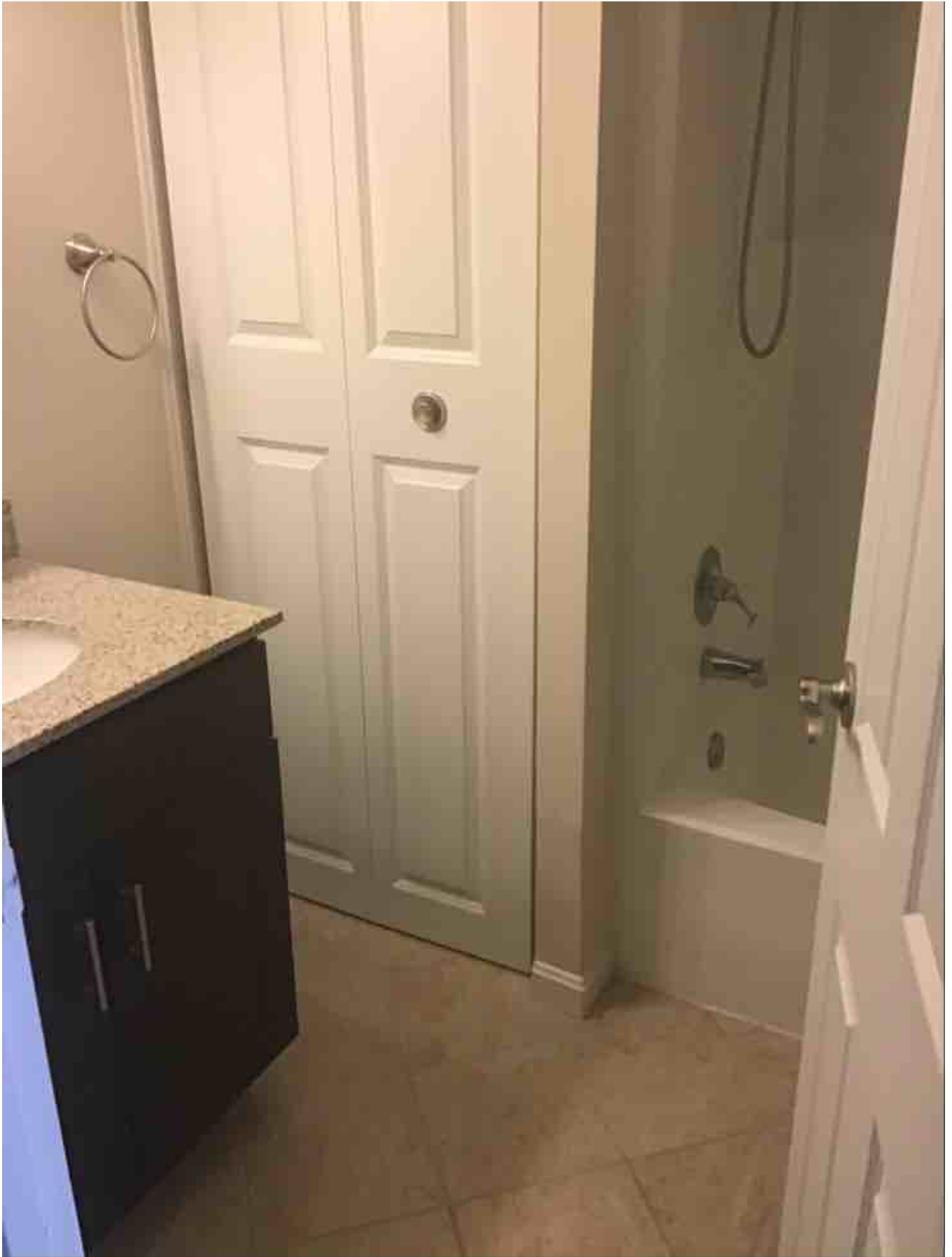
Amenity Name: Base Rent Amenity Rate: 1,550.00 Amenity Note: