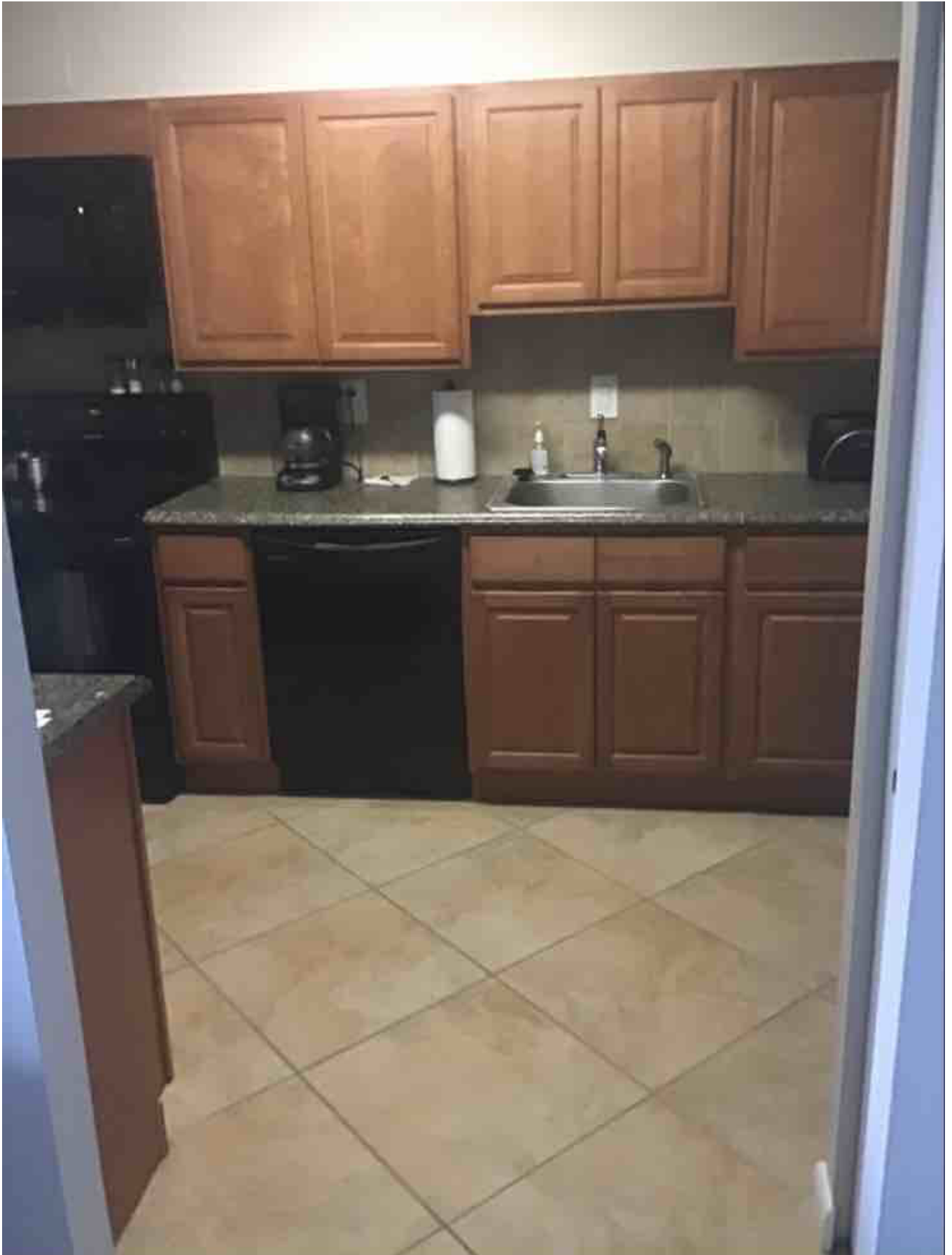
Amenity Name: Forest View Amenity Rate: 15.00 Amenity Note: