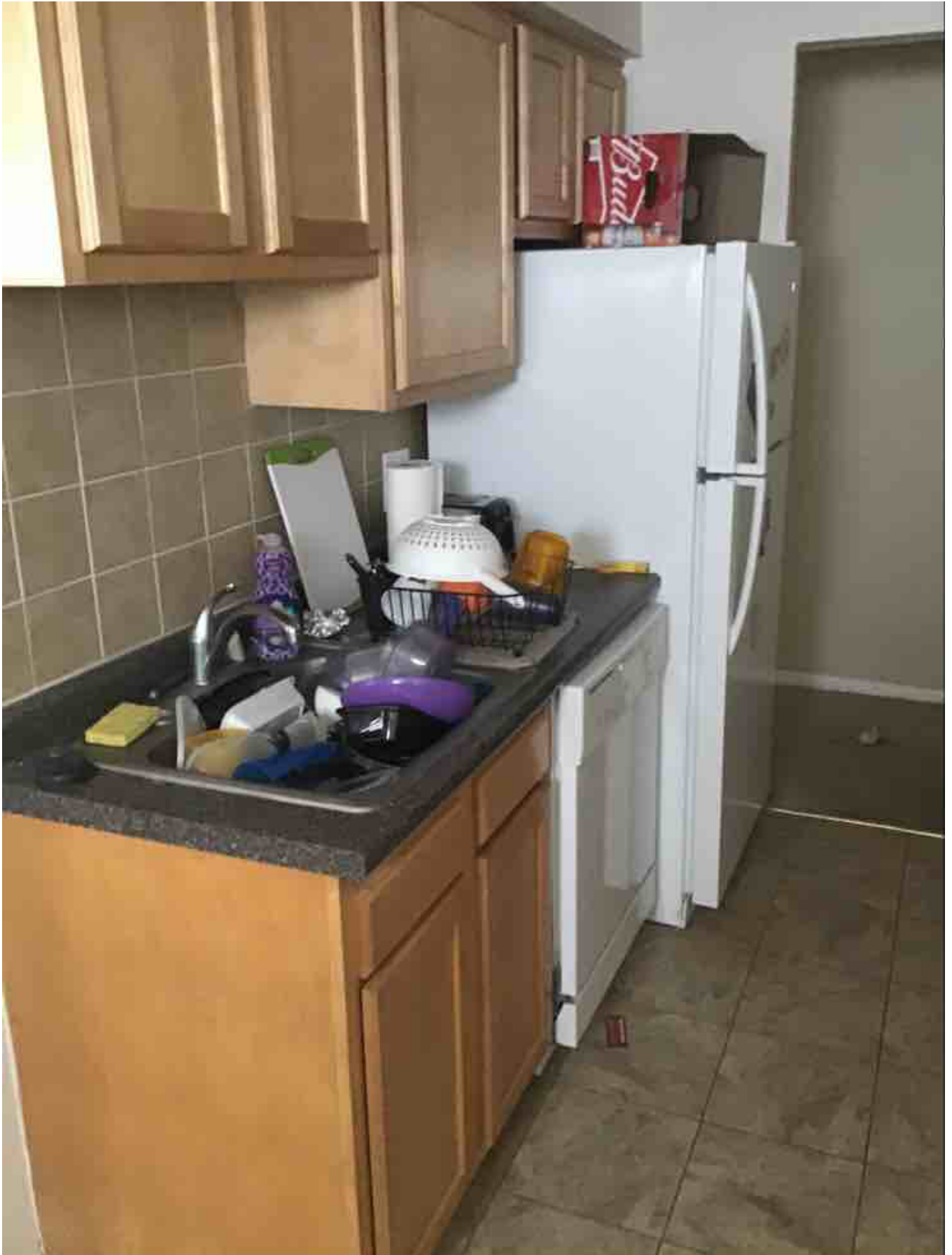
Amenity Name: View (Neg) Amenity Rate: Amenity Note: