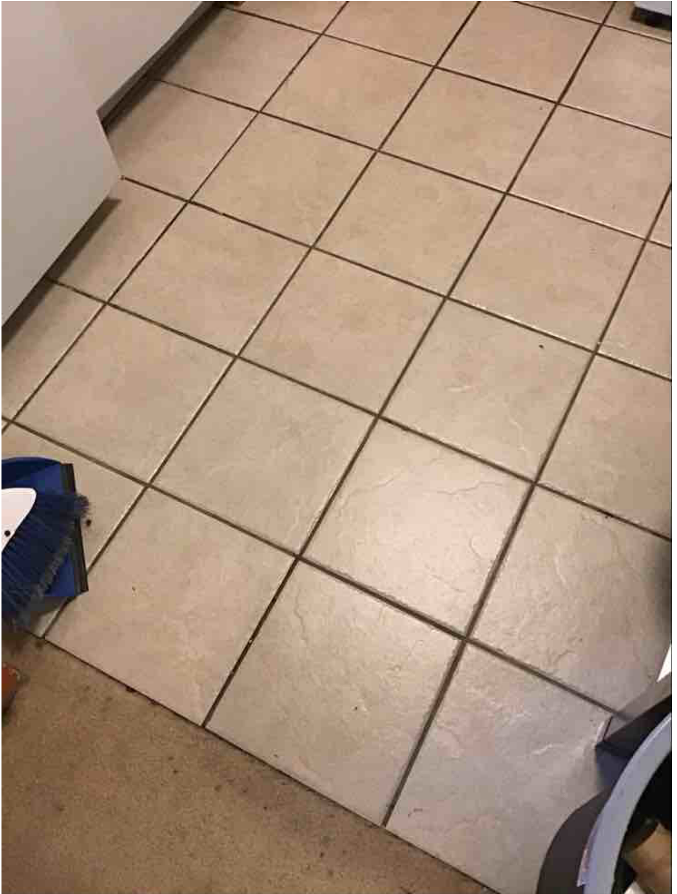
Amenity Name: Oak Kitchen Amenity Rate: 25 Amenity Note: