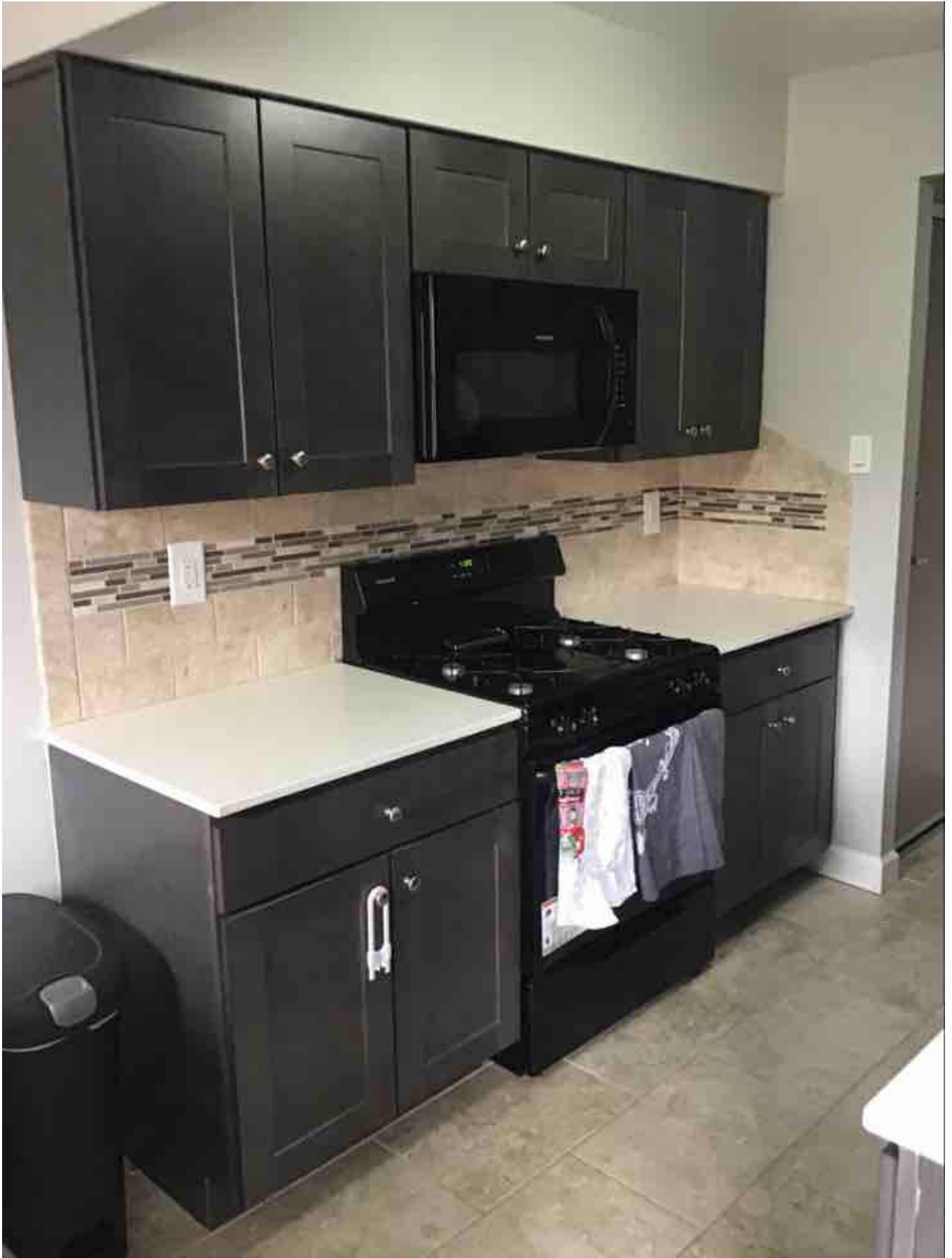
Amenity Name: Bath 2 Upgd Amenity Rate: 65.00 Amenity Note: