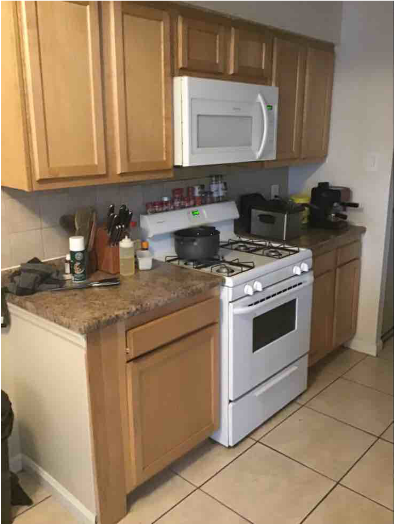
Amenity Name: Courtyard View Amenity Rate: 25 Amenity Note: