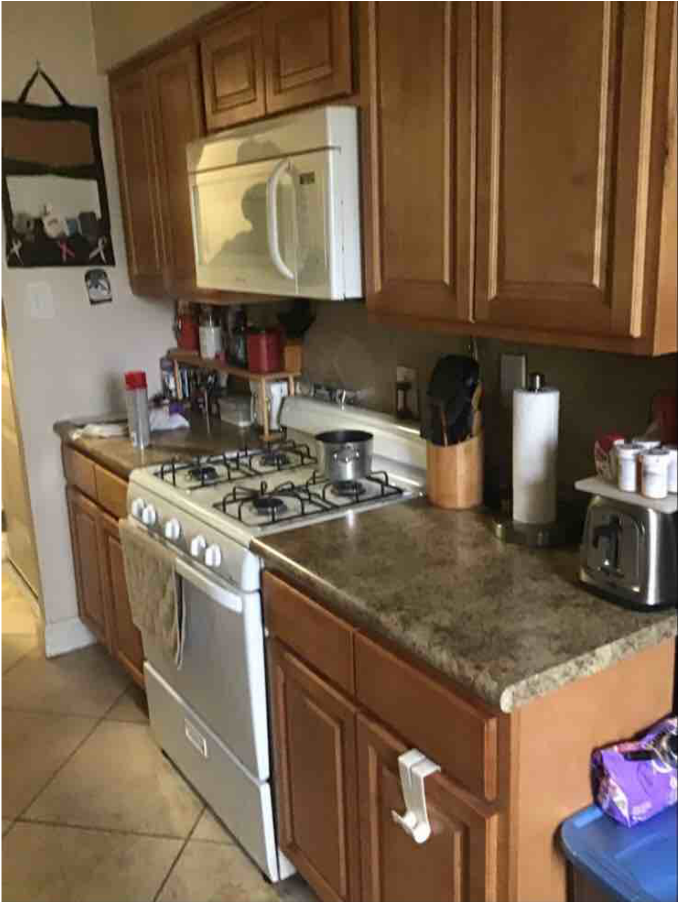
Amenity Name: Courtyard View Amenity Rate: 25 Amenity Note: