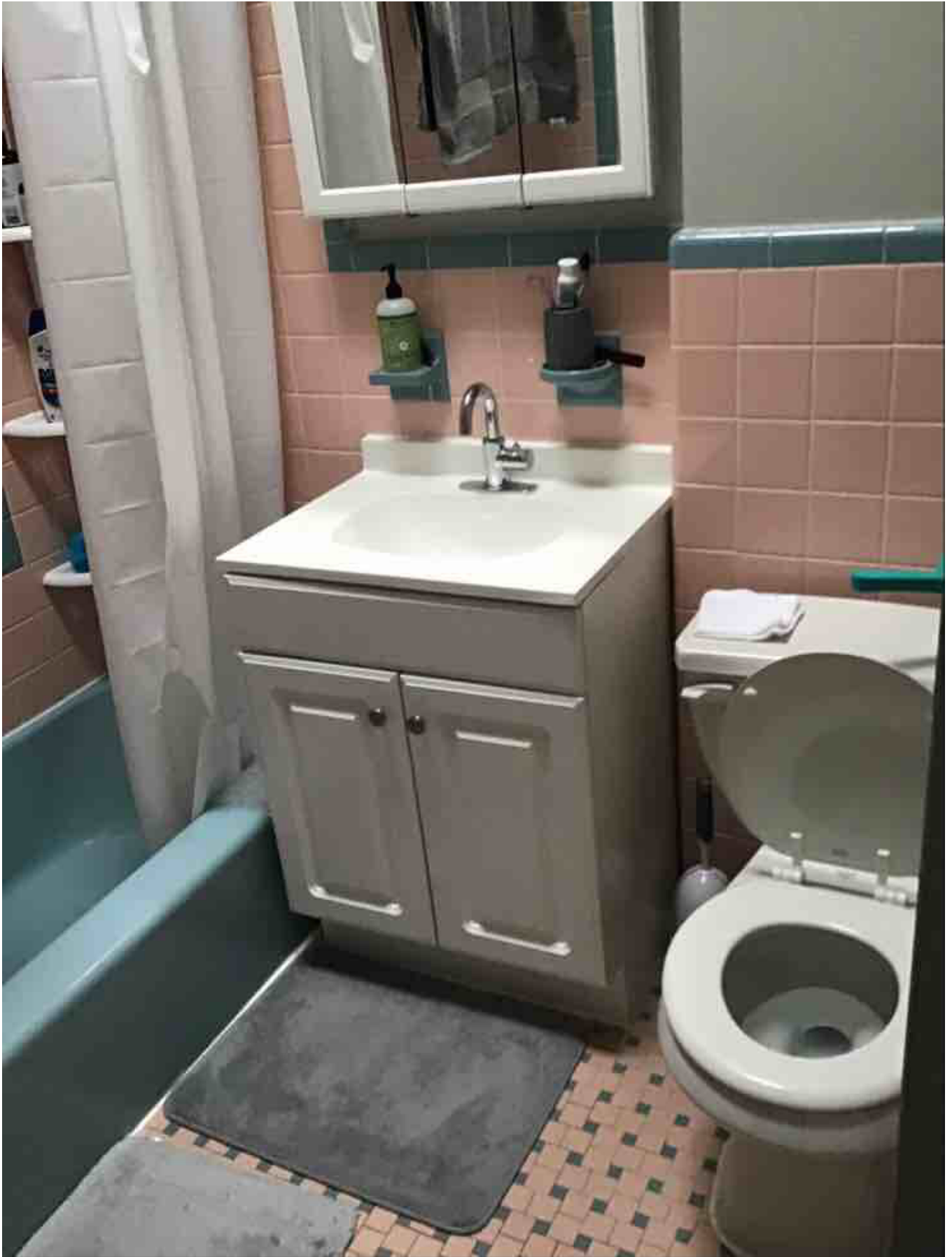
Amenity Name: Oak Kitchen Amenity Rate: 0.01 Amenity Note: