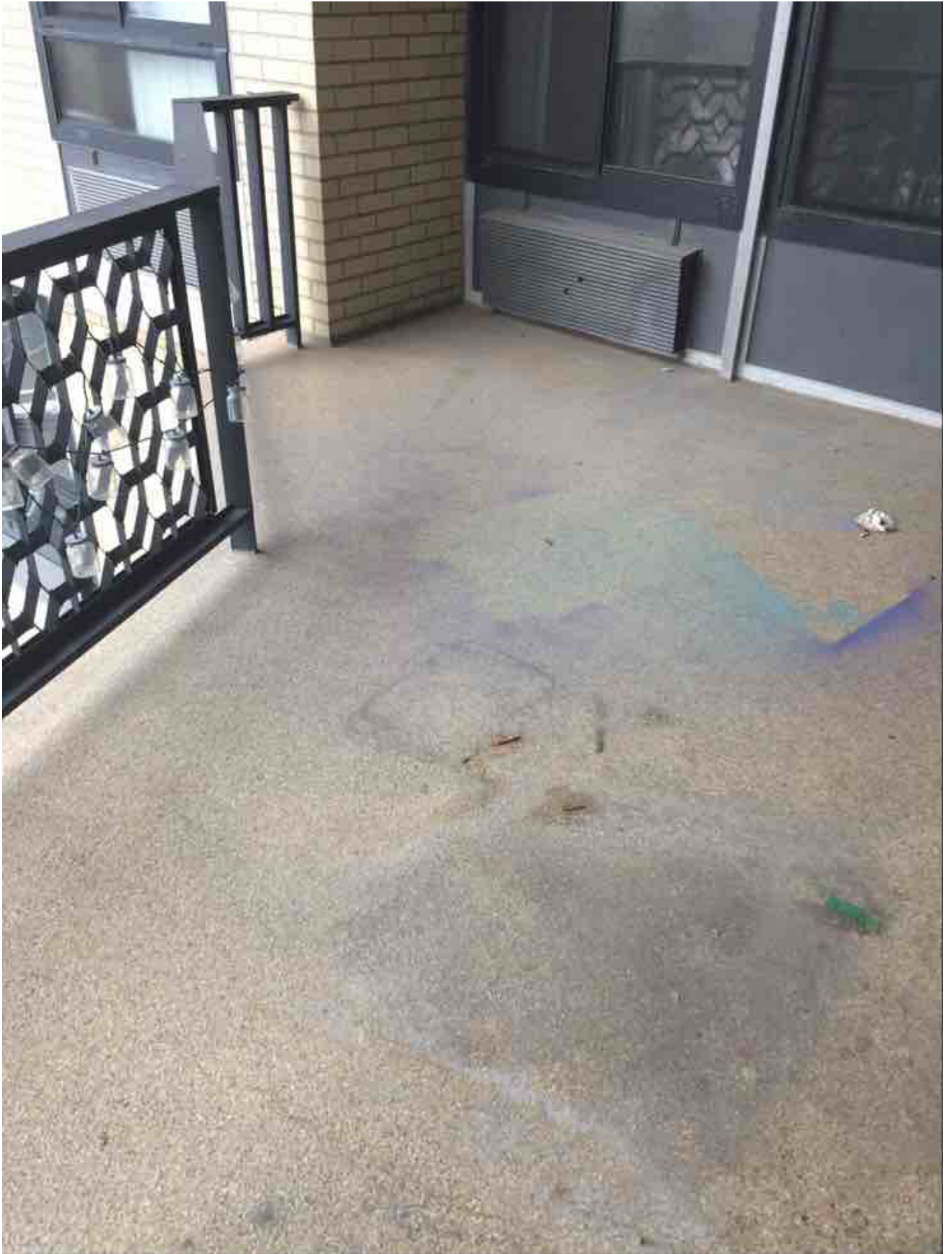
Amenity Name: Home Office Amenity Rate: 150 Amenity Note: