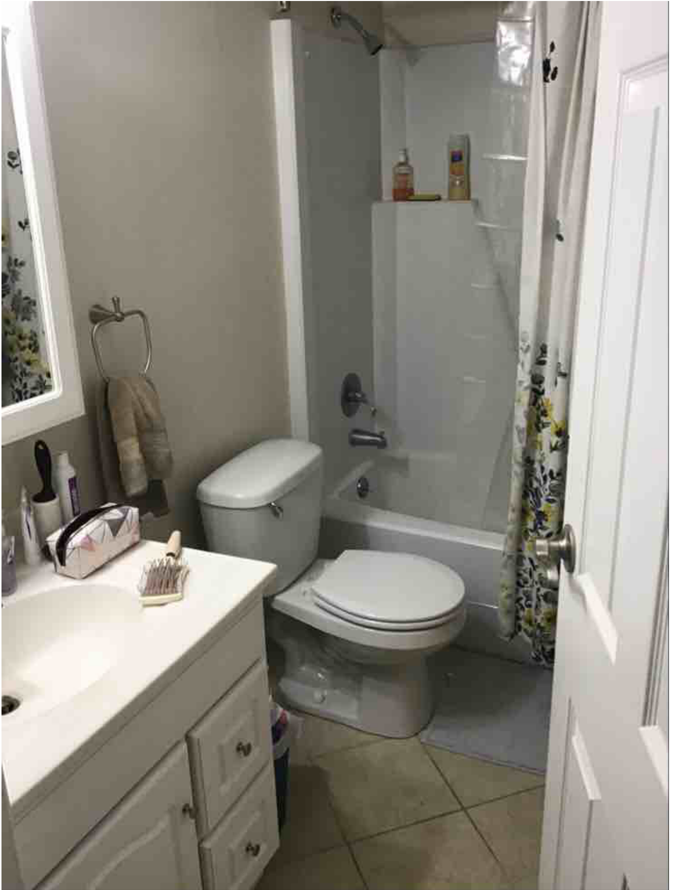
Amenity Name: Base Rent Amenity Rate: 1,410.00 Amenity Note: