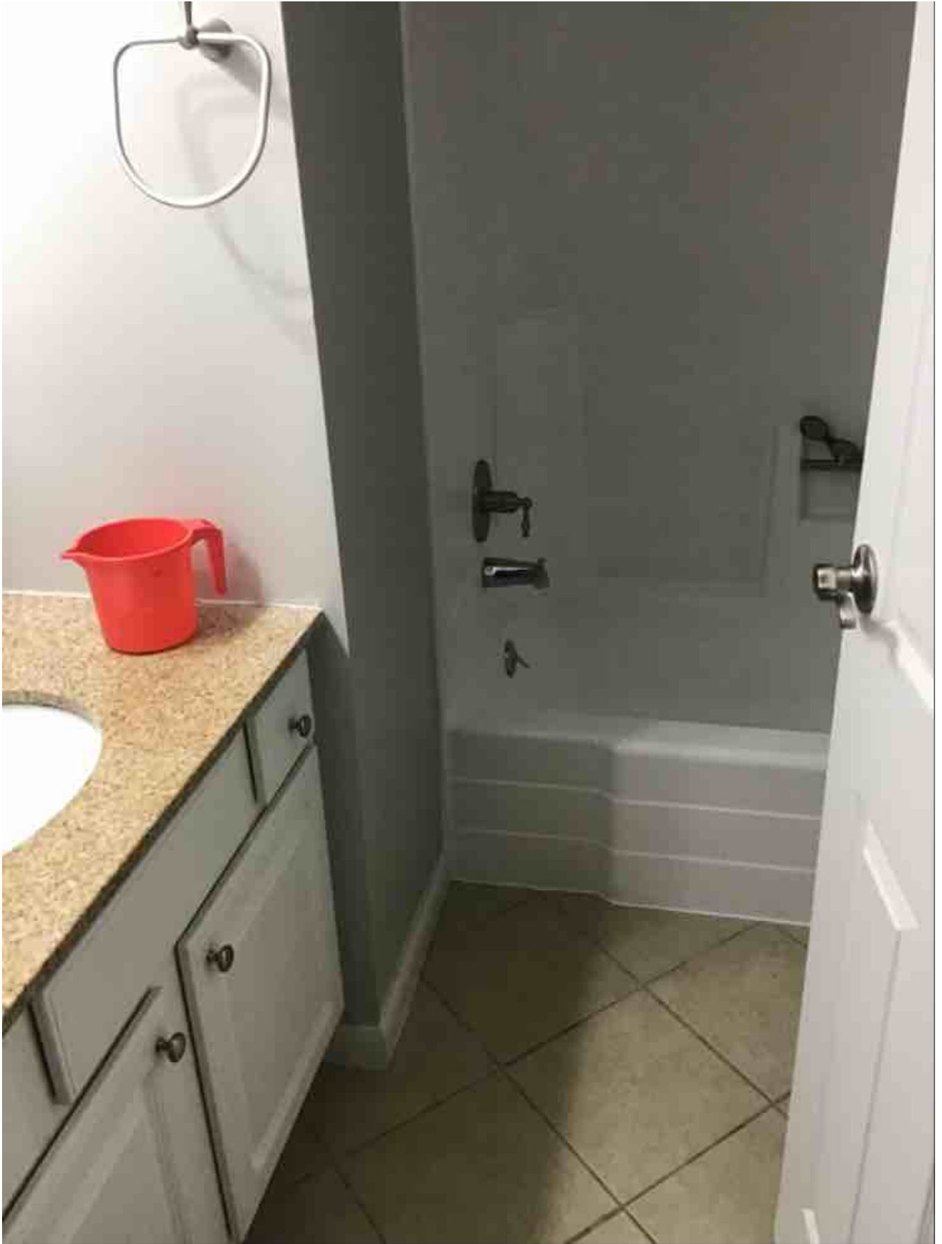
Amenity Name: Maple Kit Amenity Rate: 50.00 Amenity Note: