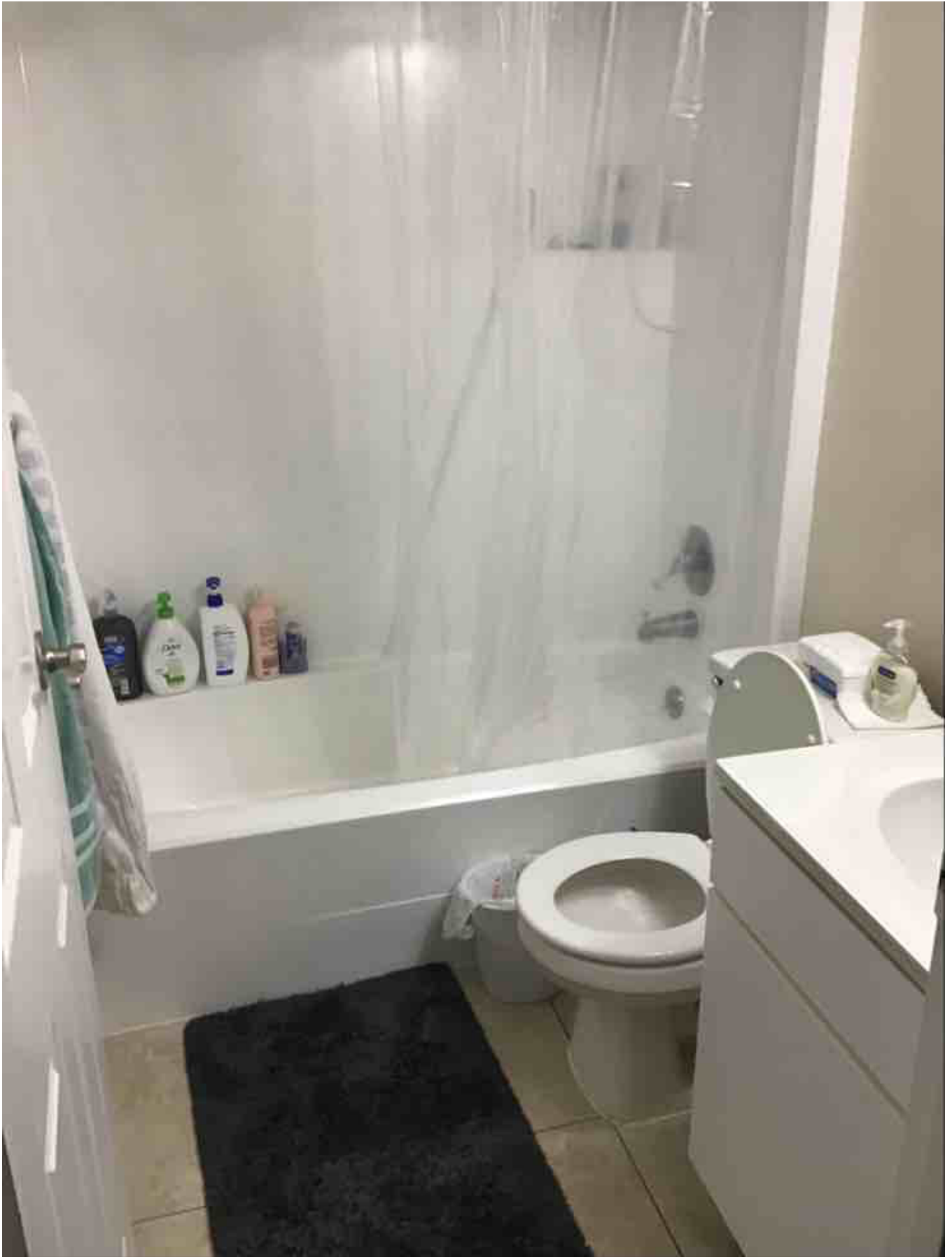
Amenity Name: Base Rent Amenity Rate: 1,300.00 Amenity Note: