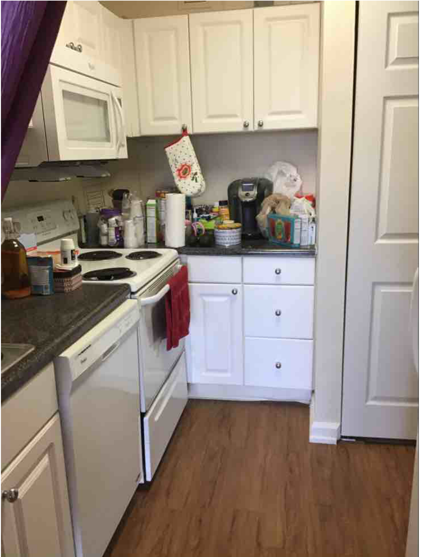
Amenity Name: Campus View Amenity Rate: 5 Amenity Note: