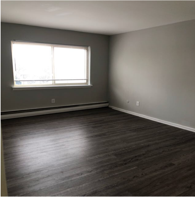
Amenity Name: Base Rent