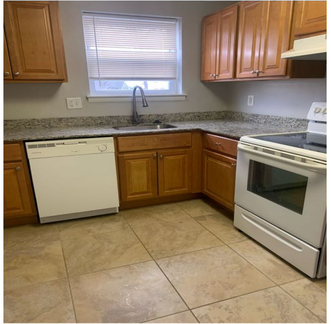
Amenity Name: Quartz Countertops