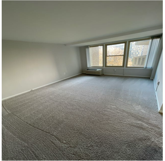
Amenity Name: TriIW