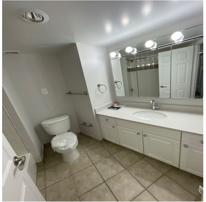
Amenity Name: TrilB