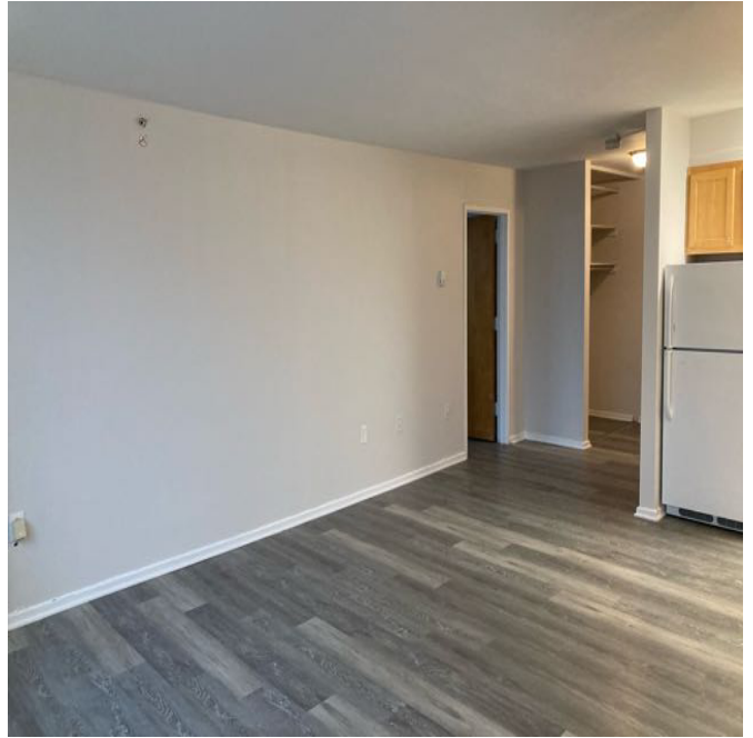
Amenity Name: Base Rent