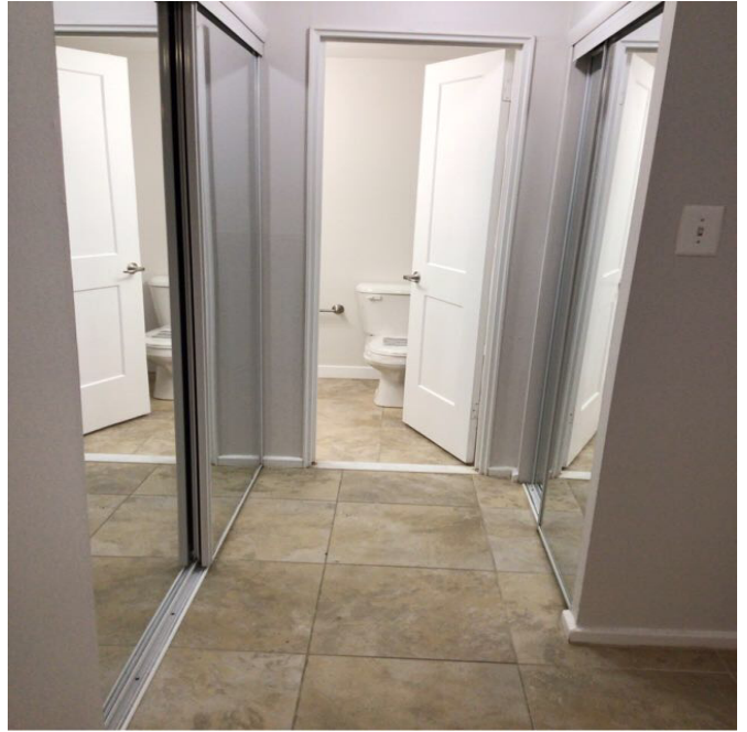
Amenity Name: Plank Flooring