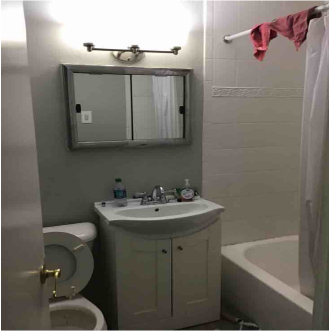
Amenity Name: 2nd Bathroom