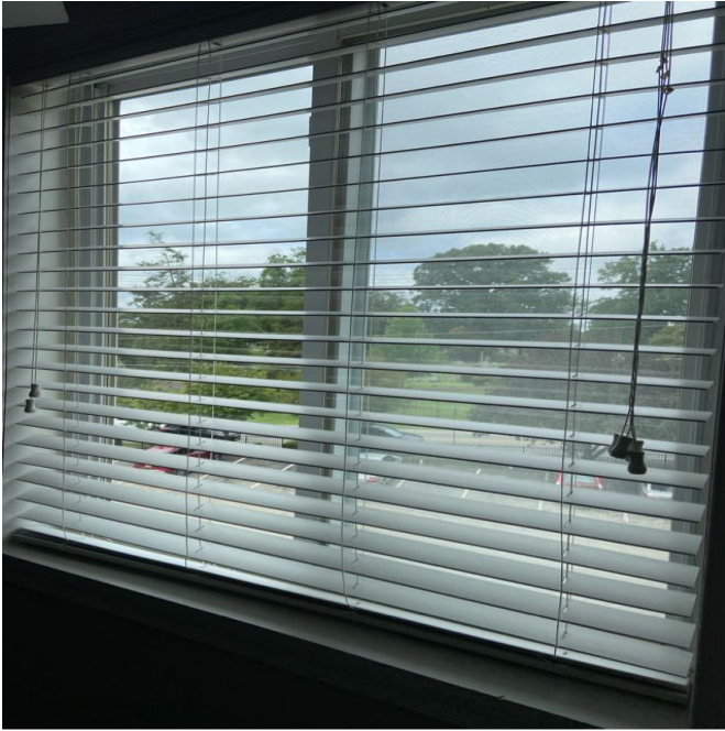
Amenity Name: White Kitchen