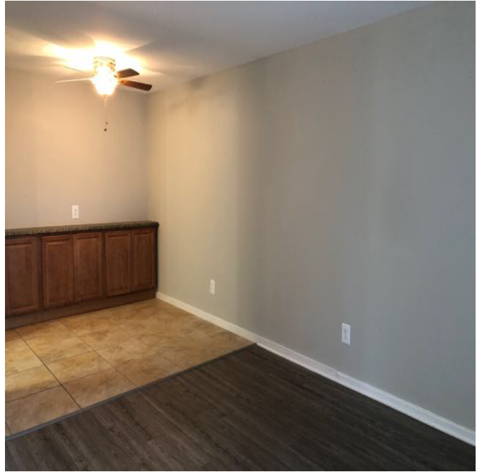
Amenity Name: Base Rent