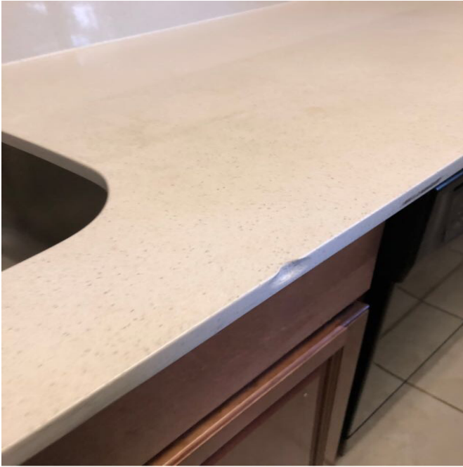
Amenity Name: RedevB