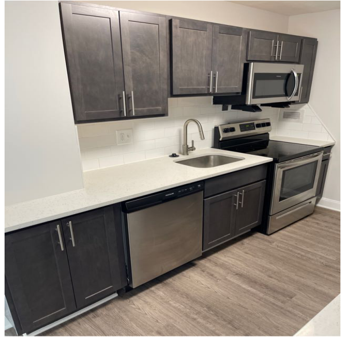
Amenity Name: Plank Flooring