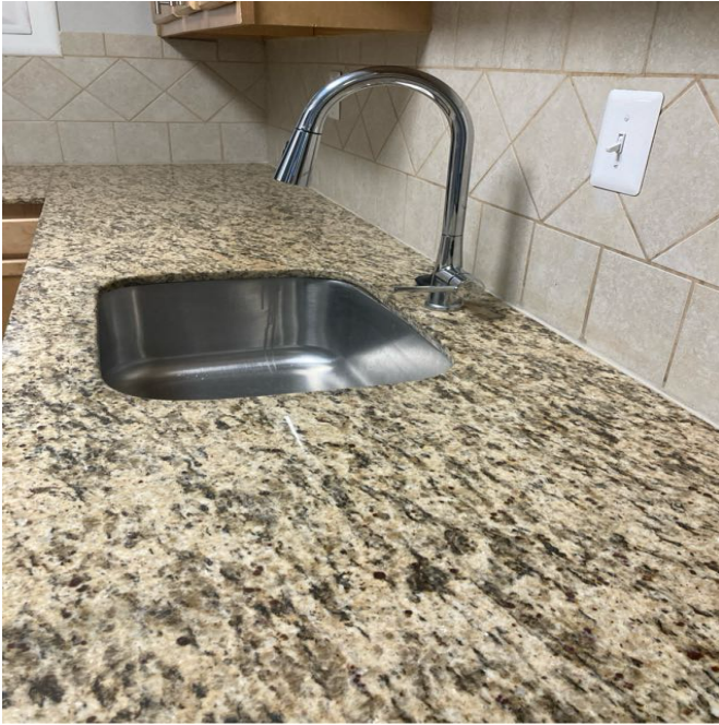
Amenity Name: Base Rent