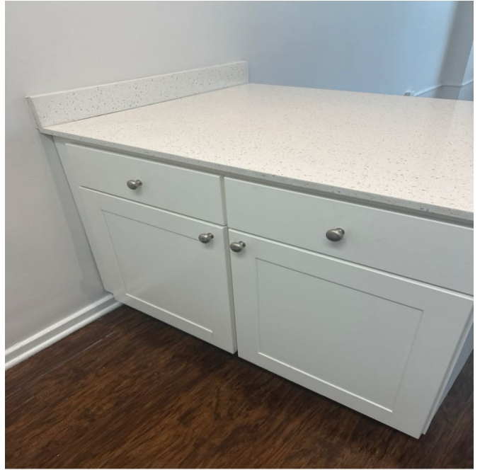
Amenity Name: Quartz Countertops