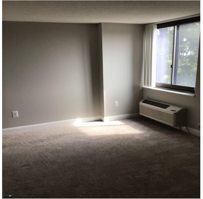
Amenity Name: TriW