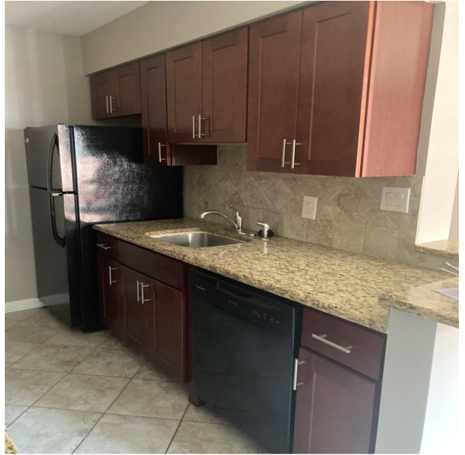
Amenity Name: Cherry Kitchen