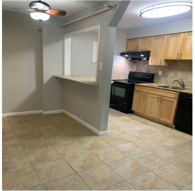
Amenity Name: Quartz Countertops