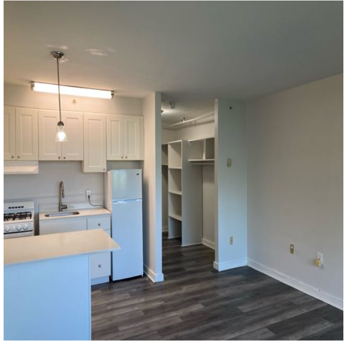
Amenity Name: 8th Floor