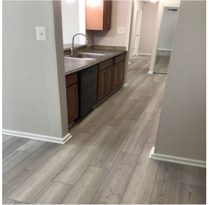
Amenity Name: Base Rent