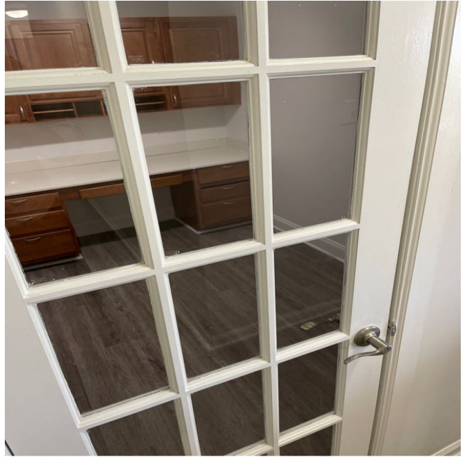
Amenity Name: RedevB