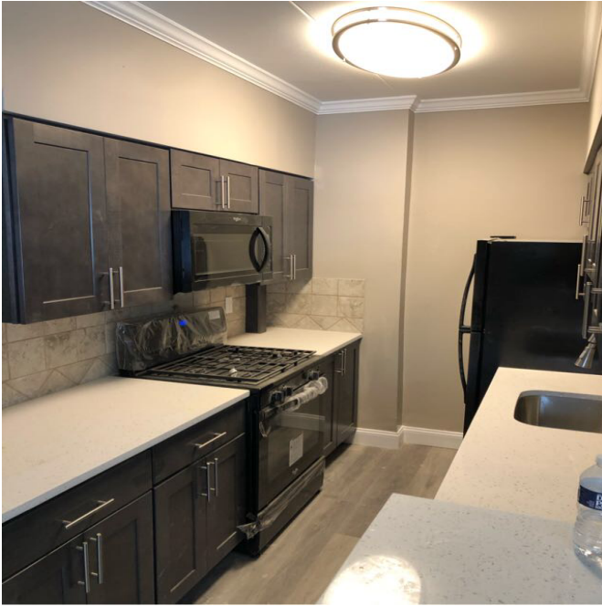
Amenity Name: Quartz Cntop