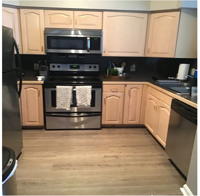
Amenity Name: Plank Flooring