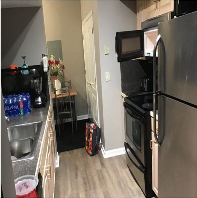
Amenity Name: View-Pos1