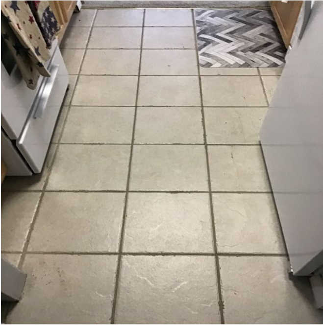
Amenity Name: White/Maple Kitchen