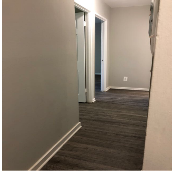
Amenity Name: Base Rent