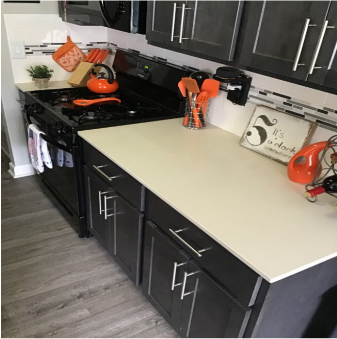
Amenity Name: Gray Kitchen