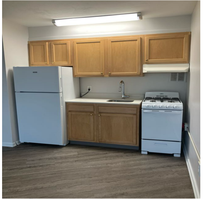
Amenity Name: Plank Flooring