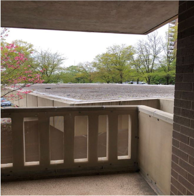
Amenity Name: TrilW