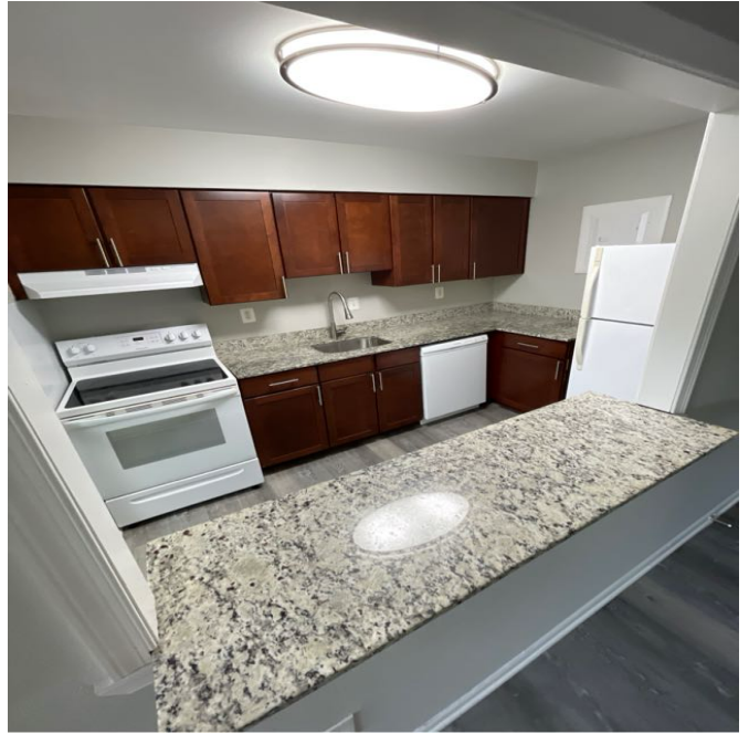
Amenity Name: Plank in Common Areas