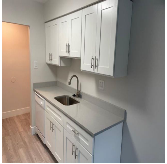
Amenity Name: Eider White