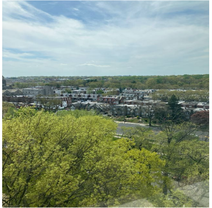
Amenity Name: Top Floor