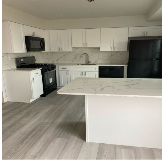
Amenity Name: Quartz Countertops