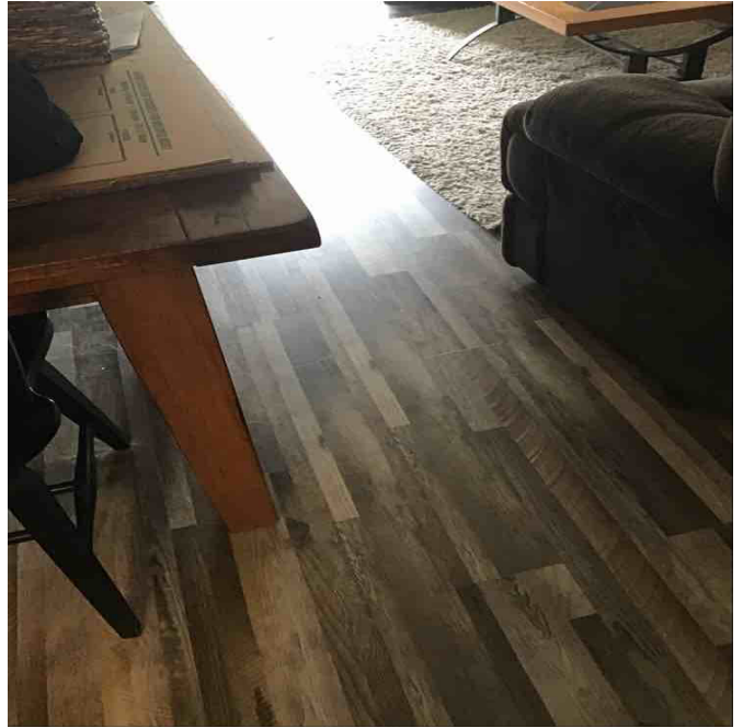
Amenity Name: Balcony 1