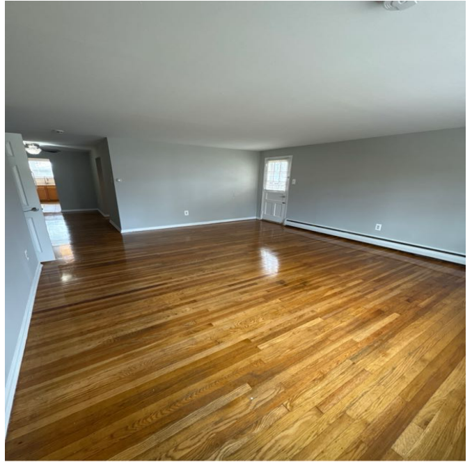
Amenity Name: Mid Upgraded Kitchen