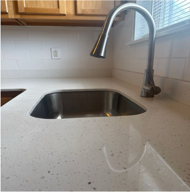
Amenity Name: Base Rent