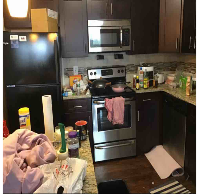
Amenity Name: Campus View