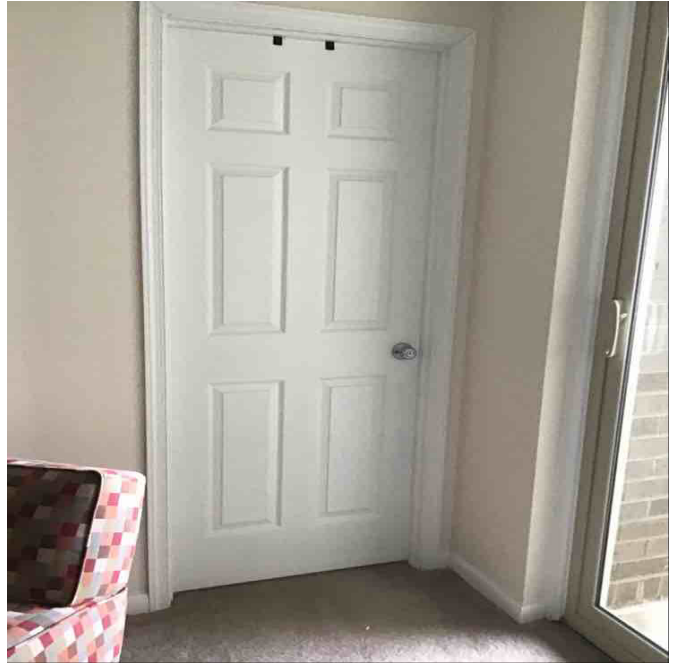
Amenity Name: Campus View