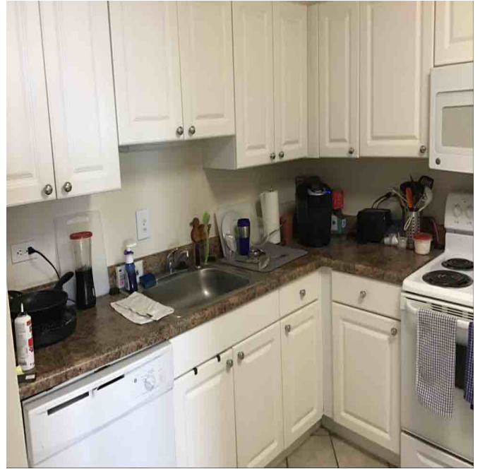
Amenity Name: City View