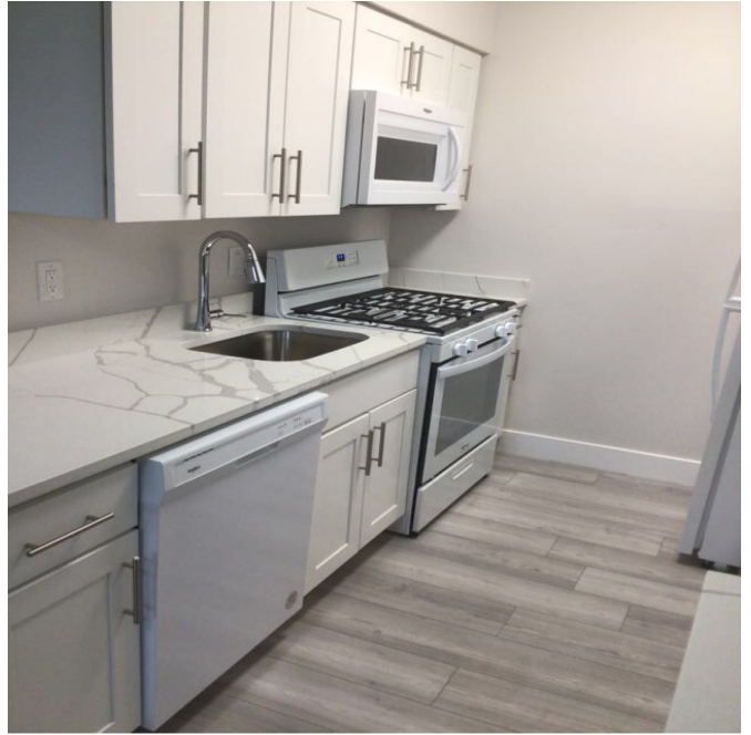
Amenity Name: Quartz Countertops