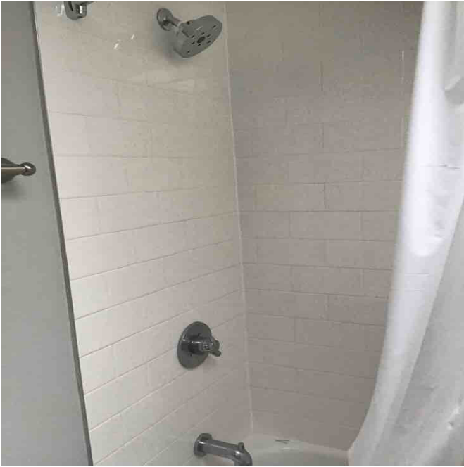
Amenity Name: Bathroom Rehab Additional