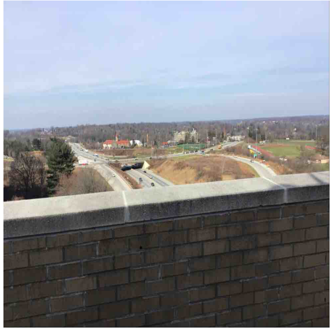
Amenity Name: Balcony 3